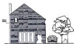
REAR (WEST) ELEVATION