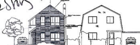
FRONT (EAST) ELEVATION