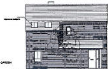
SIDE (SOUTH) ELEVATION