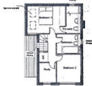
FIRST FLOOR 1:100