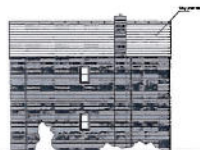
SIDE (NORTH) ELEVATION